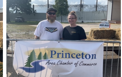
1st place, Chili: ABRA Auto Body & Glass