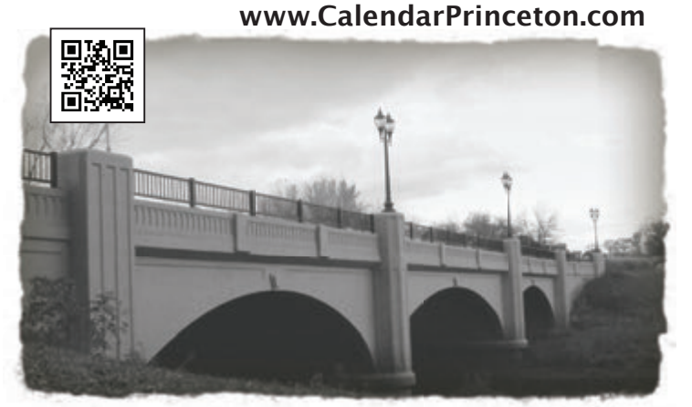
Are you looking for something to do this weekend? Your one stop source for events happening around town!

- This article was written by Edward Jones for use by your local Edward Jones Financial Advisor.