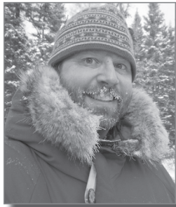
Sparky's Presentations are at:

Location: on Sherburne County Road 9, five miles west of HWY 169. Watch for signs.